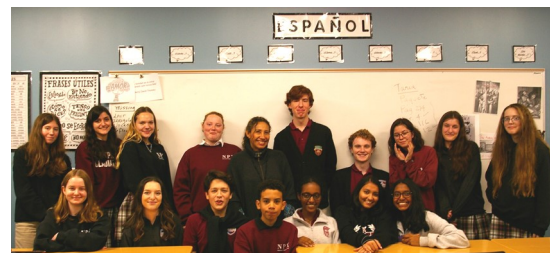
Spanish II students.