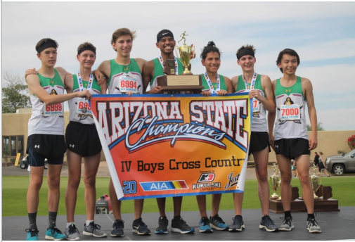
Cross Country runners at state meet.