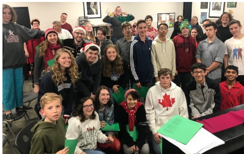
NPX community members prepare to go caroling.