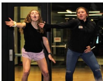
"Love is an open doooooor!"