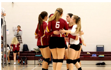
Varsity volleyball.

The North Phoenix Prep Middle School and High School volleyball teams have had an impressive start to their season and have been showing other teams and their fans that hard work really does pay off. The Varsity volleyball team has done especially well. They started the season off by defeating Basis Phoenix, then went on to beat St. John Paul, Arete Prep, North Pointe Prep, and Lincoln Prep. Along the way they set a team record of 6-2. Almost undefeated, they lost to Anthem Prep and Ray High School. Let's continue to support our Gladiators as they finish up the season! Great job ladies and keep up the good work!