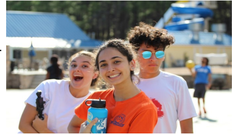
Seniors all smiles kicking off their last year at NPX.

This year, the NPX high school was fortunate enough to go to Lost Canyon for a school retreat. It was great to be able to see people who you might not have seen all summer and just hang out and catch up on old business. The student's time there was occupied with a variety of different ac-