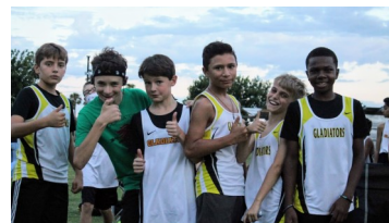
Middle school cross country.