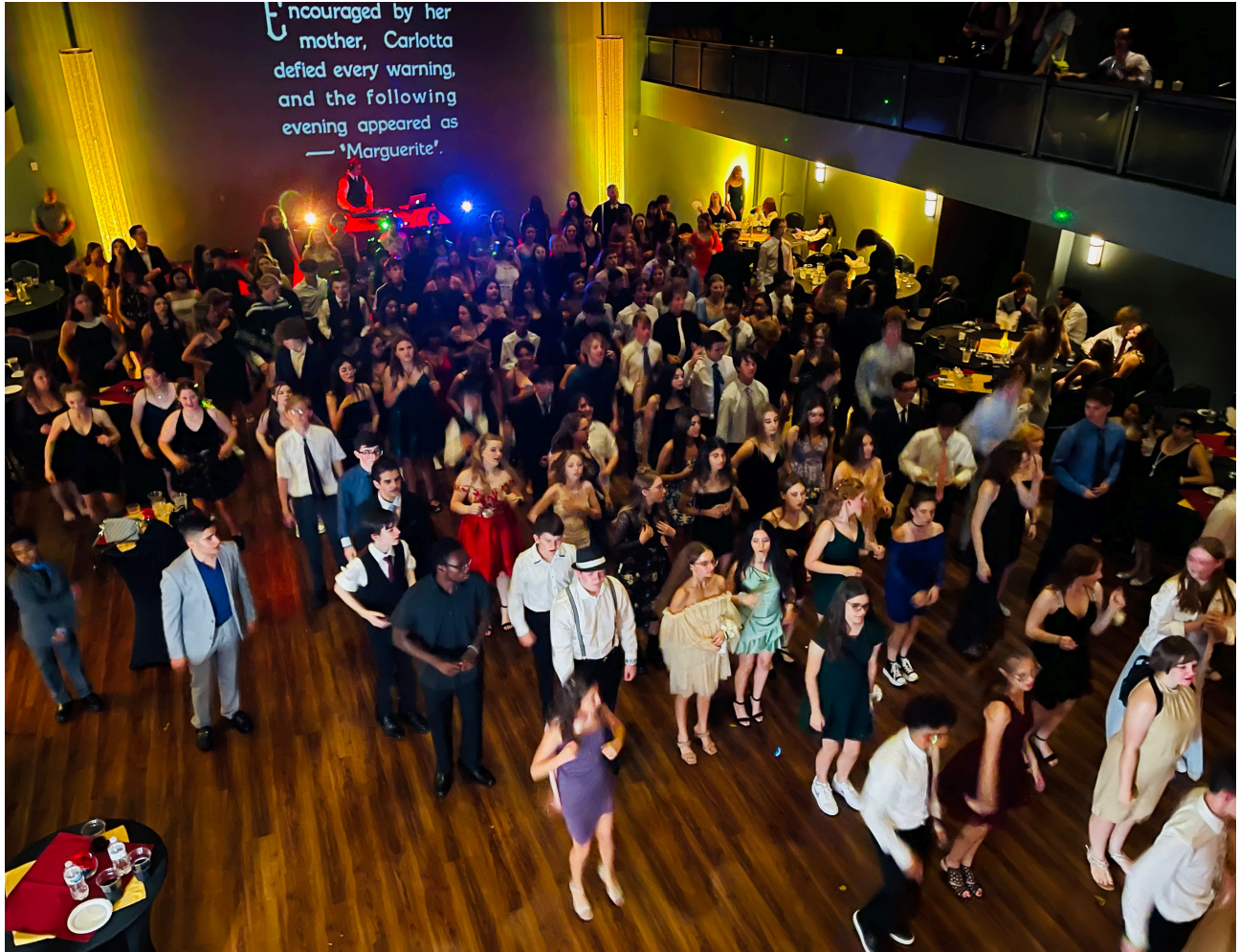
Dancing in unison to the Cha-Cha Slide !

Our Senators planned and executed the best Homecoming in the history of NPX! Over 200 students were in attendance dancing the night away. It was a beautiful event at the Arizona Broadway Theater. St