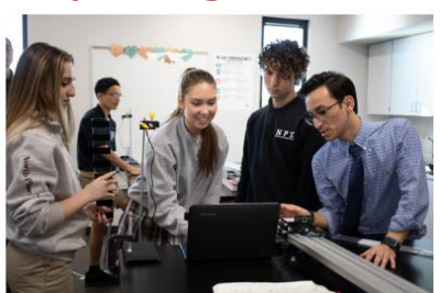
Community Investment School Security, Low Student to Teacher Ratio, Boutique College Counseling, Fine Arts Program, Classroom Equipment