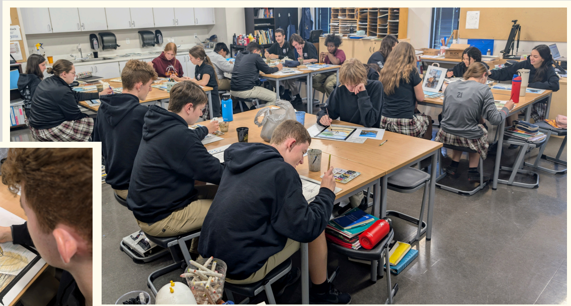
The 11th grade art students working on watercolor paintings