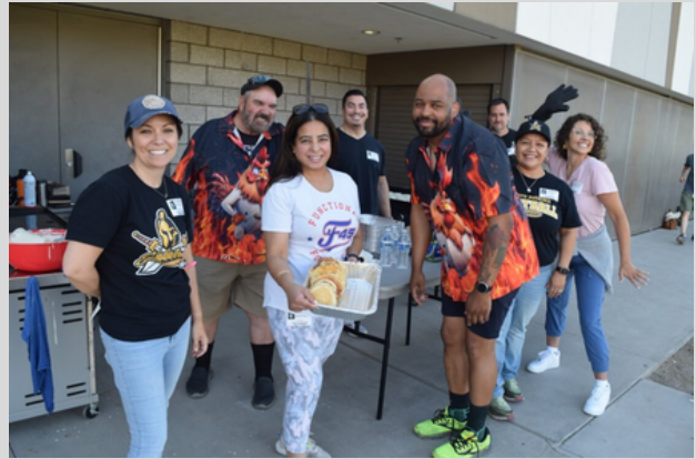
Our Fearless PSO Volunteers who served us pancakes!

We have had yet another amazing field day to put in the books! First some Thank Yous to everybody who helped make this day possible: