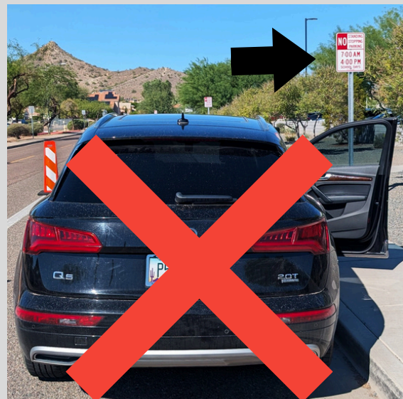
NO STOPPING ON HEARN'S TURN LANE

Please be a good driving role model for your scholars