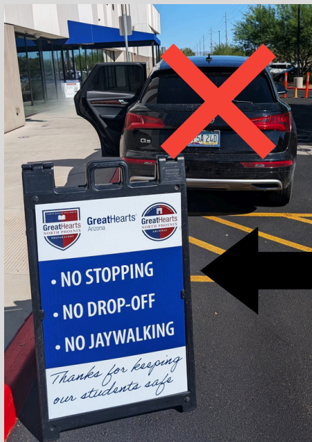
NOT STOPPING IN FIRELANE IN FRONT OF SCHOOL

Your cooperation makes a huge difference in the well-being of our students. Thank you for helping our school be a safe and courteous place for everyone.