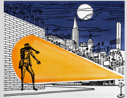
4/16 The Pedestrian, short story by Ray Bradbury (it's just two pages!)