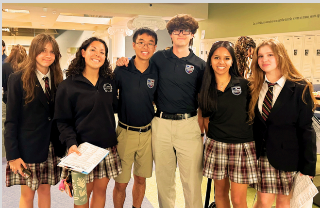
Class of 2027 at Great Hearts' College Symposium